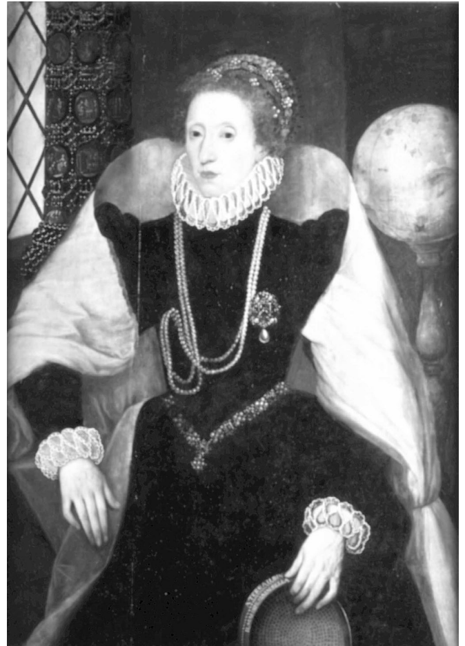
Sieve Portrait of Queen Elizabeth I (c. 1580-1583) Circle of Quentin Massys the Younger Private Collection

Draw your own portrait of Queen Elizabeth based on what you have seen and read in this exhibit. Think about different symbols that you can include to show her power.